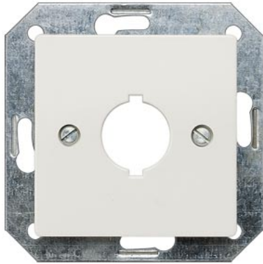
DELTA i-system titanium white cover plate 55 x 55 mm for built-in command devices for diameter 18.5 mm