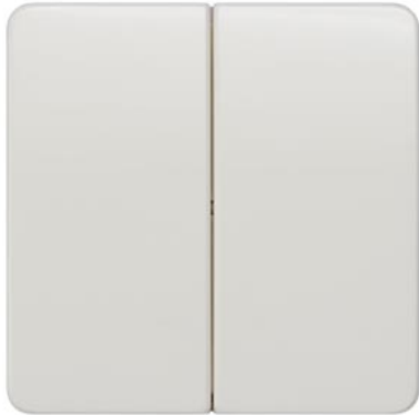
DELTA profil, titanium white Rocker switch, 65x 65 mm for series/double two-way switch for double pushbutton for pushbutton 2-fold Mid-position