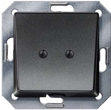
DELTA i-system carbon metallic outlet plate, 55x 55 mm