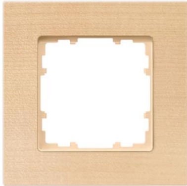
DELTA miro Frame 1-fold Authentic material wood Wood type beech Dimensions 90x 90 mm