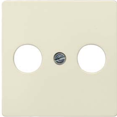
DELTA i-system electrical white antenna cover plate 55x 55 mm for broadband connection socket RF/TV