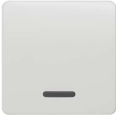
DELTA profil, titanium white Rocker switch, 65x 65 mm for pilot lamp/off/changeover switch for pushbutton with separate feedback signal