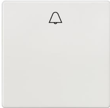
DELTA i-system titanium white Rocker switch with bell symbol for pushbutton, 55x55 mm