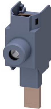
1-phase supply terminal, for contactors 3RT204, 3RT244 and 3RT264