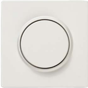
DELTA style, titanium white Cover plate for dimmer with rotary knob 68x 68 mm