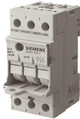
SENTRON, cylindrical fuse holder, 10x38 mm, 3-pole, In: 32 A, Un AC: 690 V, compact version