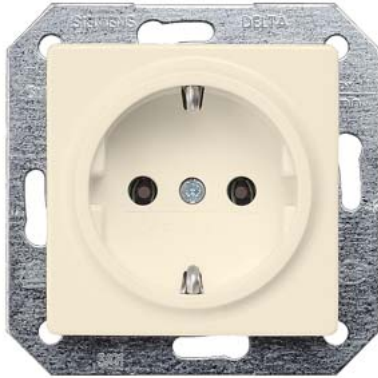
DELTA i-system electrical white SCHUKO socket outlet 10/16 A 250 V With screwless Connection terminals cover plate 55 x 55 mm