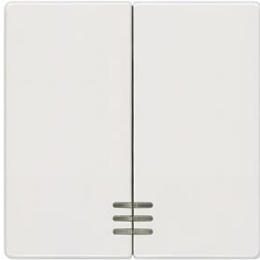
DELTA i-system titanium white Rocker switch with window for Series/double two-way switch 55x 55 mm