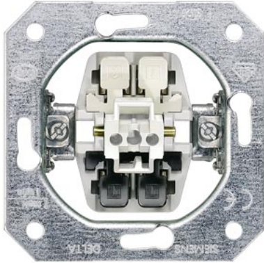
DELTA switch device insert FM, OFF switch 2-pole without claws 10A 250V