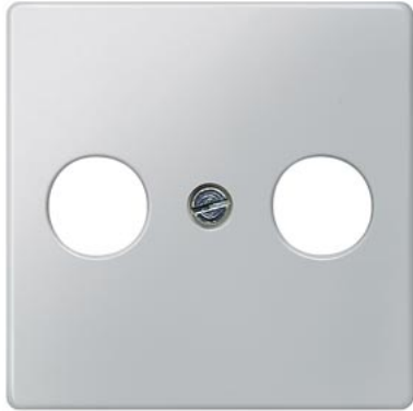
DELTA i-system aluminum-metallic Antenna cover plate 55x 55 for broadband connection socket RF/TV