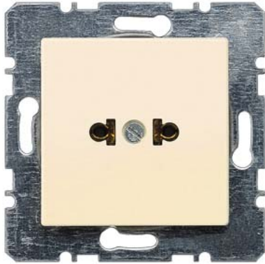
DELTA i-system electrical white Socket outlet 15A 125V American standard C73 Central plate 51x 51mm