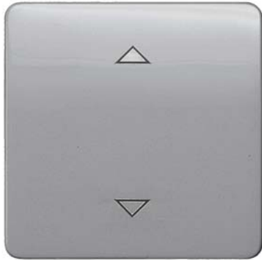
DELTA profil, silver Rocker switch with shutter symbols for pushbutton 1-fold Mid-position 65x 65 mm