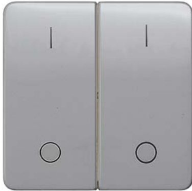
DELTA profil, silver Rocker switch with symbols I0 for pushbutton 2-fold Mid-position 65x 65 mm