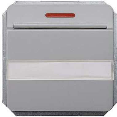
DELTA profil, silver HotelCard switch 1 change-over contact, illuminated