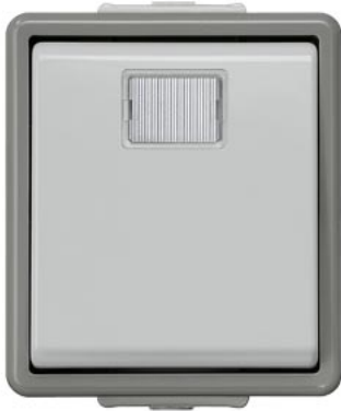
DELTA flaeche IP44, AP Dark gray/light gray button, 10A 250V with separate feedback signal with white window, 66x 75 mm