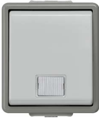
DELTA fläche IP44, AP Dark gray/light gray Control switch switchover 10A 250V, 66x 75 mm