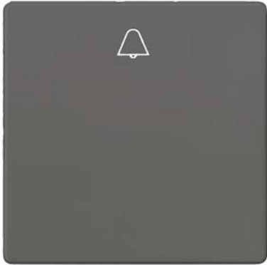
DELTA i-system carbon metallic Rocker switch with bell symbol for pushbutton, 55x 55 mm