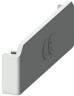
end cap for pin busbar compact 10 units safe to touch