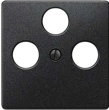
DELTA i-system Cover plate TV/RF/SAT 3-hole carbon metallic