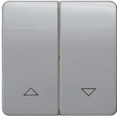
DELTA profil, silver Rocker switch with shutter symbols for shutter pushbutton, 65x 65 mm