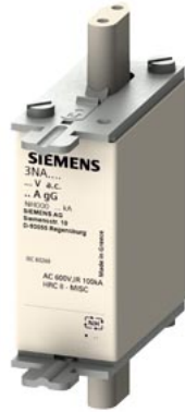
LV HRC fuse element, NH000, In: 25 A, gG, Un AC: 690 V, Un DC: 250 V, Front indicator, live grip lugs