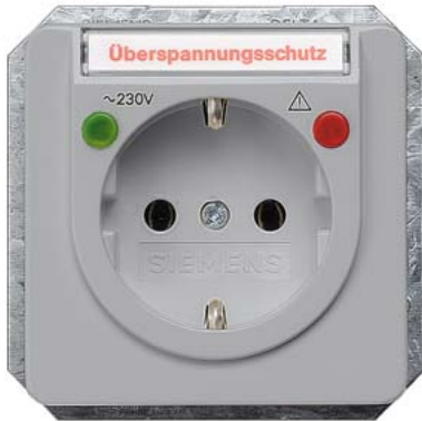
DELTA profil silver SCHUKO overvoltage protection, function indicator, labeling field 10/16 A 250 V 65x 65 mm