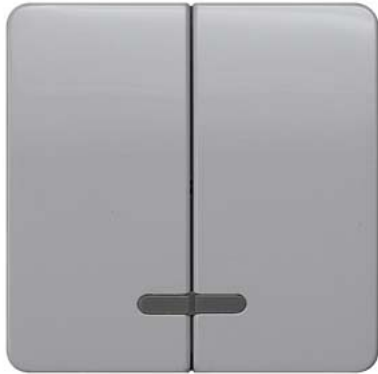
DELTA profil, silver Rocker switch with window for pushbutton 2-fold for pushbutton 2-fold Mid-position 65x 65 mm