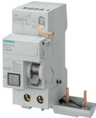
RC unit for 5SY, 2-pole, type A, In: 40 A, 300 mA, Un AC: 230 V