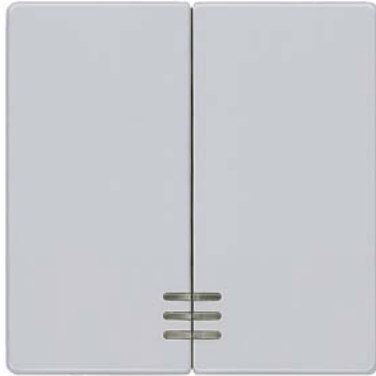
DELTA i-system aluminum-metallic Rocker switch with window for series/double two-way switch 55x 55 mm