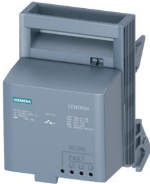
Handle unit with EFM10, for Size NH000, accessory for fuse switch disconnecter 3NP1