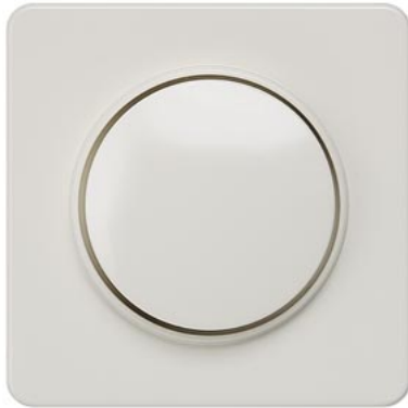
DELTA profil, titanium white Cover plate for dimmer with rotary knob 65x 65 mm