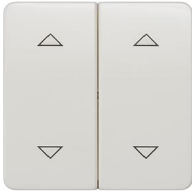
DELTA profil, titanium white Rocker switch with shutter symbols for pushbutton 2-fold Mid-position 65x 65 mm