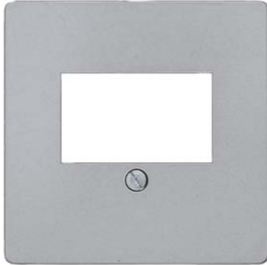
DELTA i-system cover plate 55 x 55 mm for TAE connection socket and loudspeaker connection socket aluminum-metallic