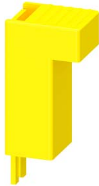
control kit for contactors 3RT2.3, 3RT2.4