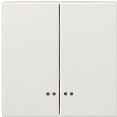
DELTA style, platinum metallic Rocker switch with window for two-circuit switch for pushbutton 2-fold Mid-position for double pushbutton, 68x 68 mm