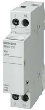
SENTRON, cylindrical fuse holder, 10x38 mm, 1P+N, In: 32 A, Un AC: 690 V