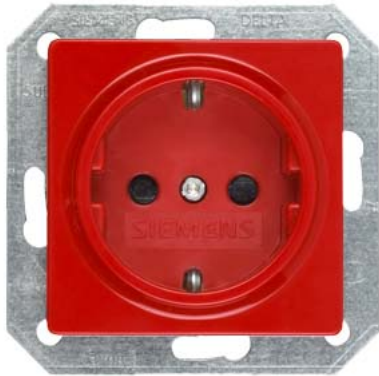
DELTA i-system SCHUKO socket outlet with increased touch protection red, 55x55 mm