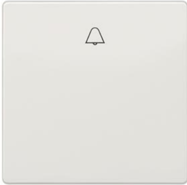
DELTA style, platinum metallic Rocker switch with bell symbol for pushbutton, 68x68 mm