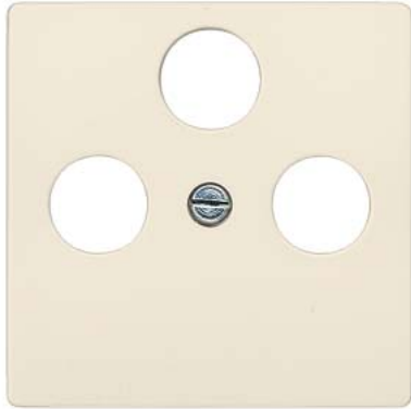
DELTA i-system Cover plate TV/RF/SAT 3-hole electrical white