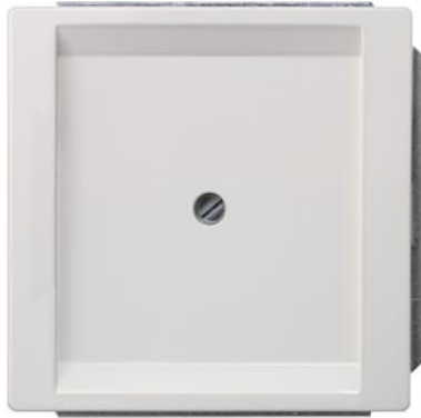
DELTA style, titanium white blanking plate, 68x 68 mm