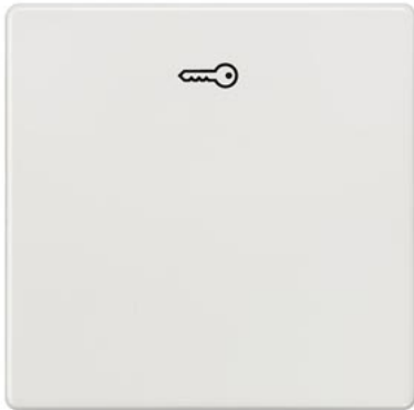
DELTA i-system titanium white Rocker switch with door opener symbol for pushbutton, 55x 55 mm