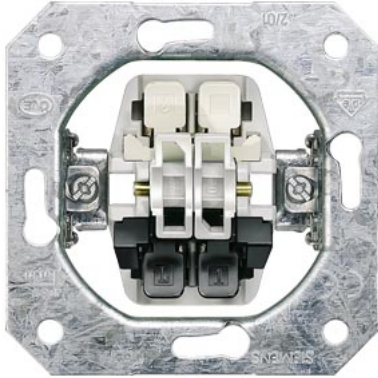
DELTA switch device insert FM, shutter switch Mechanically interlocked without claws 10A 250V