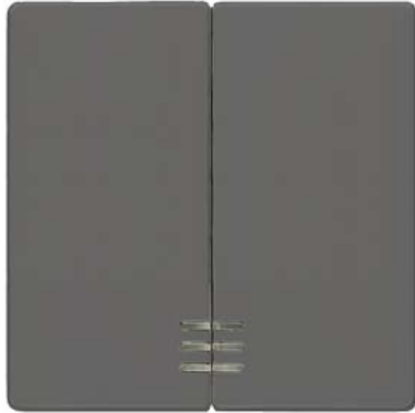
DELTA i-system carbon metallic Rocker switch with window for Series/double two-way switch 55x 55 mm