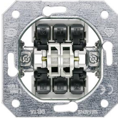
DELTA switch device insert FM, double two-way switch without claws 10A 250V