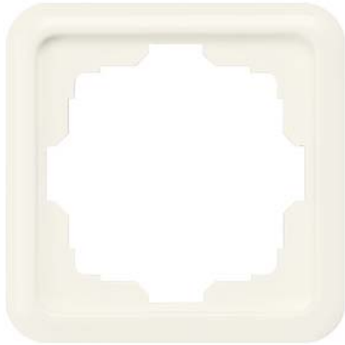
DELTA profil silver frame single, with large cutout 80 x 80 mm