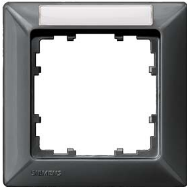
DELTA line, carbon metallic frame 1-fold, 80x 80 mm with labeling field