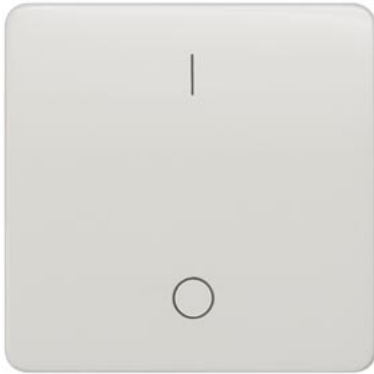
DELTA profil, titanium white Rocker switch with symbols 10 for OFF switch 2-pole, 3-pole 65x 65 mm