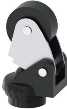
Actuator head for position switch 3SE51/52 EN 50041, Roller lever Metal lever and Plastic roller 22 mm