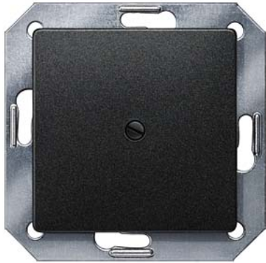
DELTA i-system carbon metallic blanking plate, 55x 55 mm