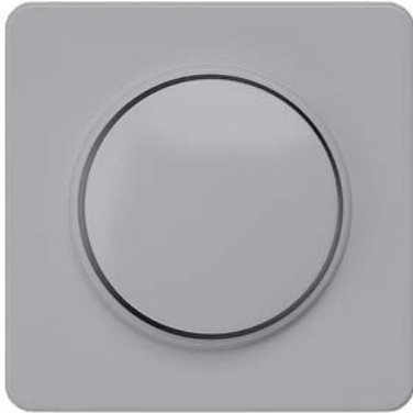
DELTA profil, silver Cover plate for dimmer with rotary knob 65x 65 mm